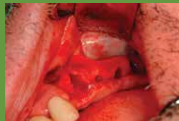
Manufactured by INION, OY

Call 888-237-2767 for up to 30% savings.