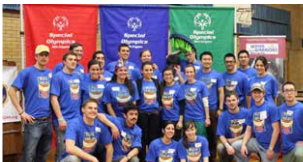
A terrific student turn out for Special Olympics Special Smiles